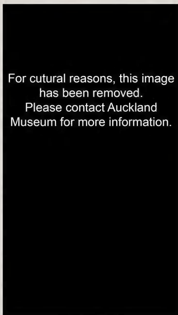
Text Fig. 9.

While the Maori could readily present the human figure in lively naturalism (Fig. 9), we encounter this form only in relief and as part